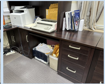
Executive desk, hutch and desk, two cabinets, and a cabinet with locking drawers $500