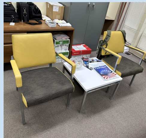
Antique chairs $25