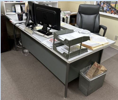
Metal desk $25