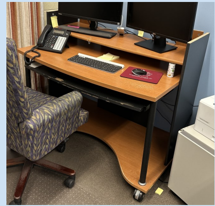
Computer Desk $50