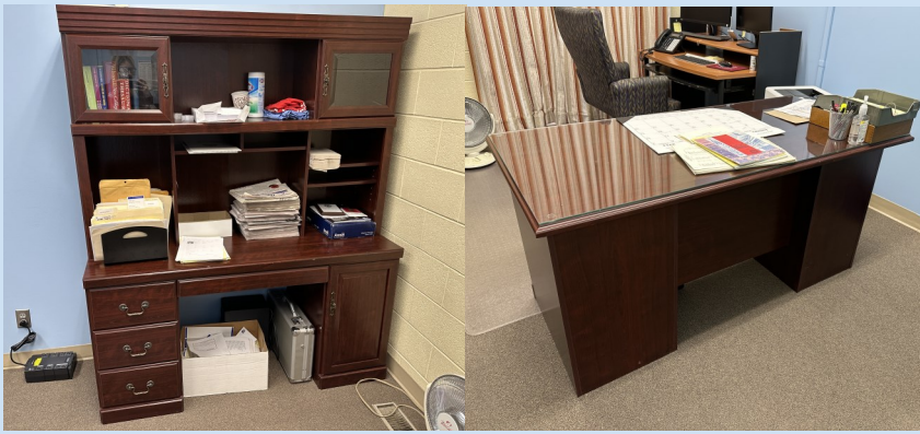
Executive desk and hutch $150