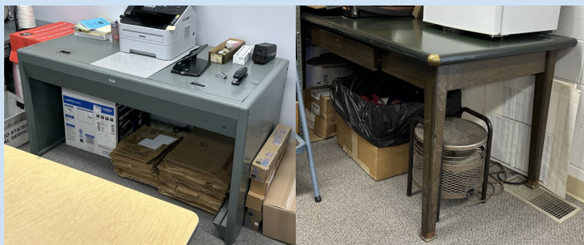
Metal desks $25 each