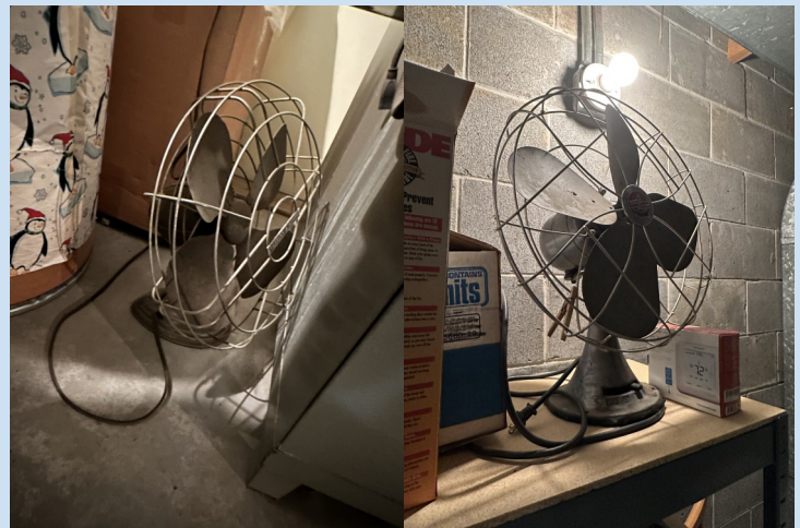
Antique fans $25 each