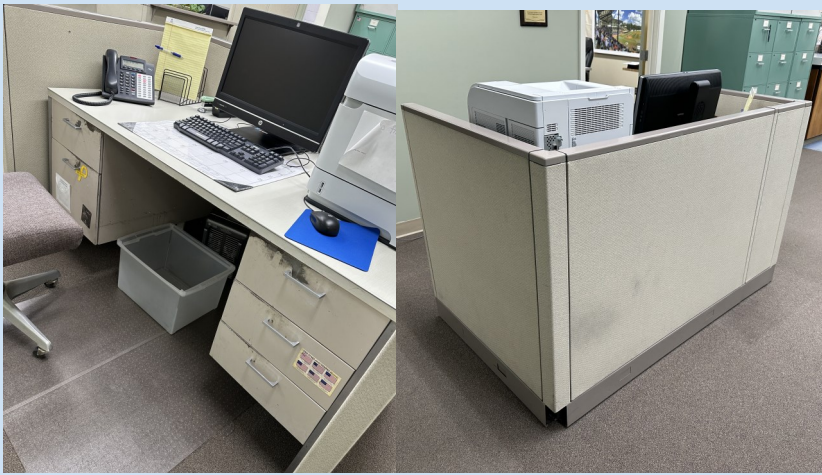
Metal desk and cubical $25