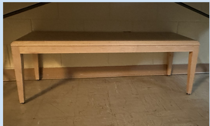
Small bench $20