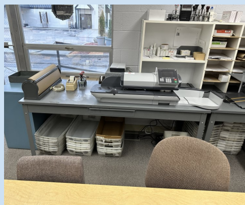
2 four foot metal tables $20 each