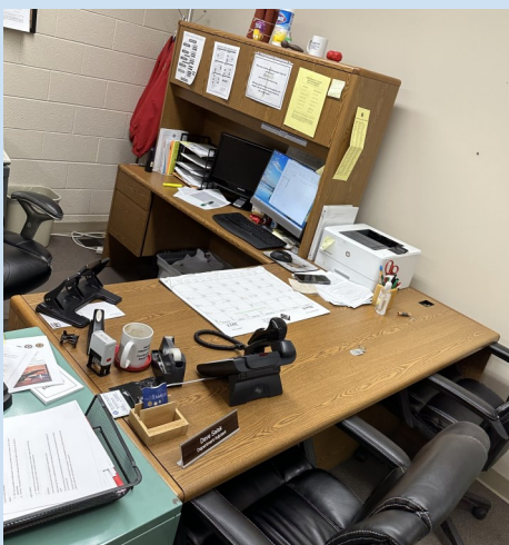
Executive Desk and hutch $100