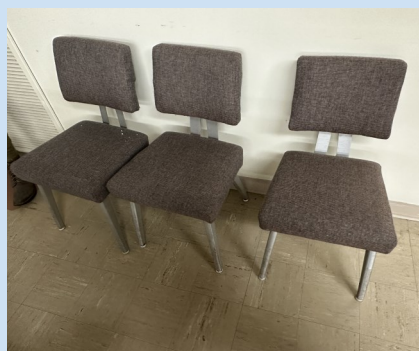
Chairs $10 each