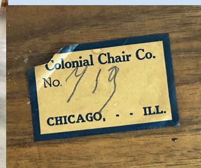
Antique chairs—contact for price