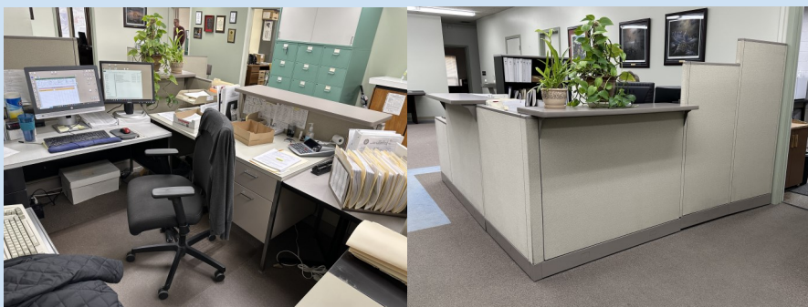
Metal desk and cubical $50