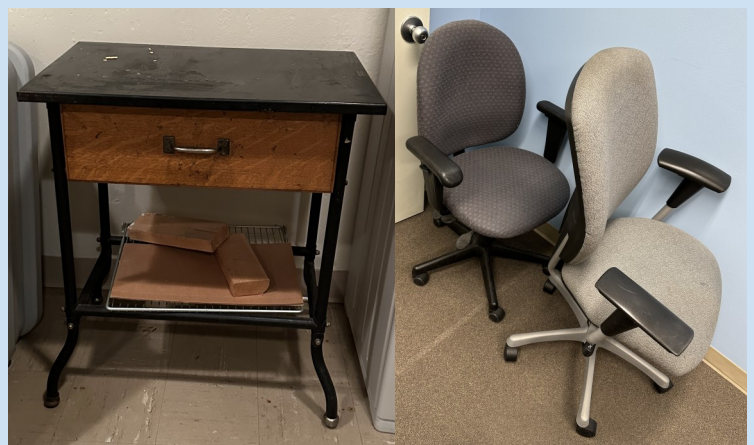
Antique cabinet and roller chairs $20 each