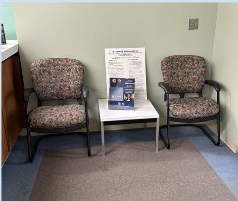
Two arm chairs $30