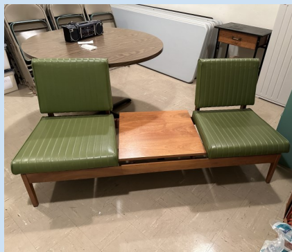
Antique bench $25