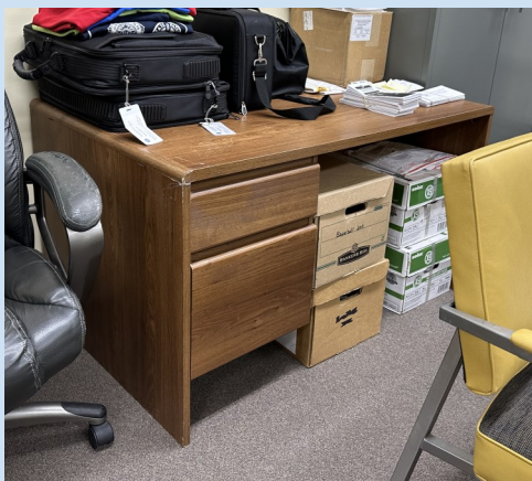
Two drawer desk $25