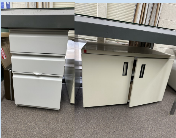
Three drawer cabinet and two door cabinet $20 each