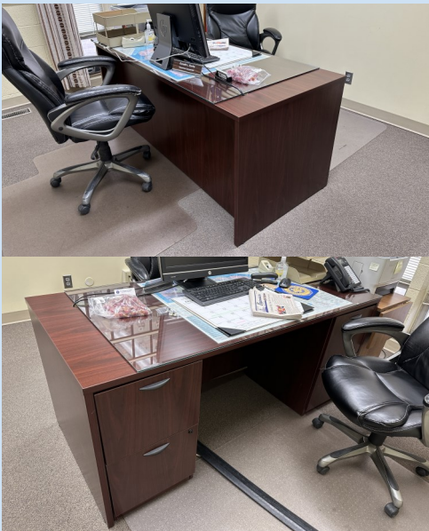
Executive desk with locking drawers $100