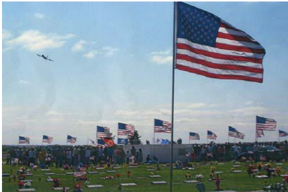
A Nebraska Air National Guard KC-135 air refueling aircraft provides an aerial salute as its crew flies over a Spalding cemetery during Memorial Day ceremonies last year. More than 100 flags ring the cemetery and complete the avenue of flags shown above.